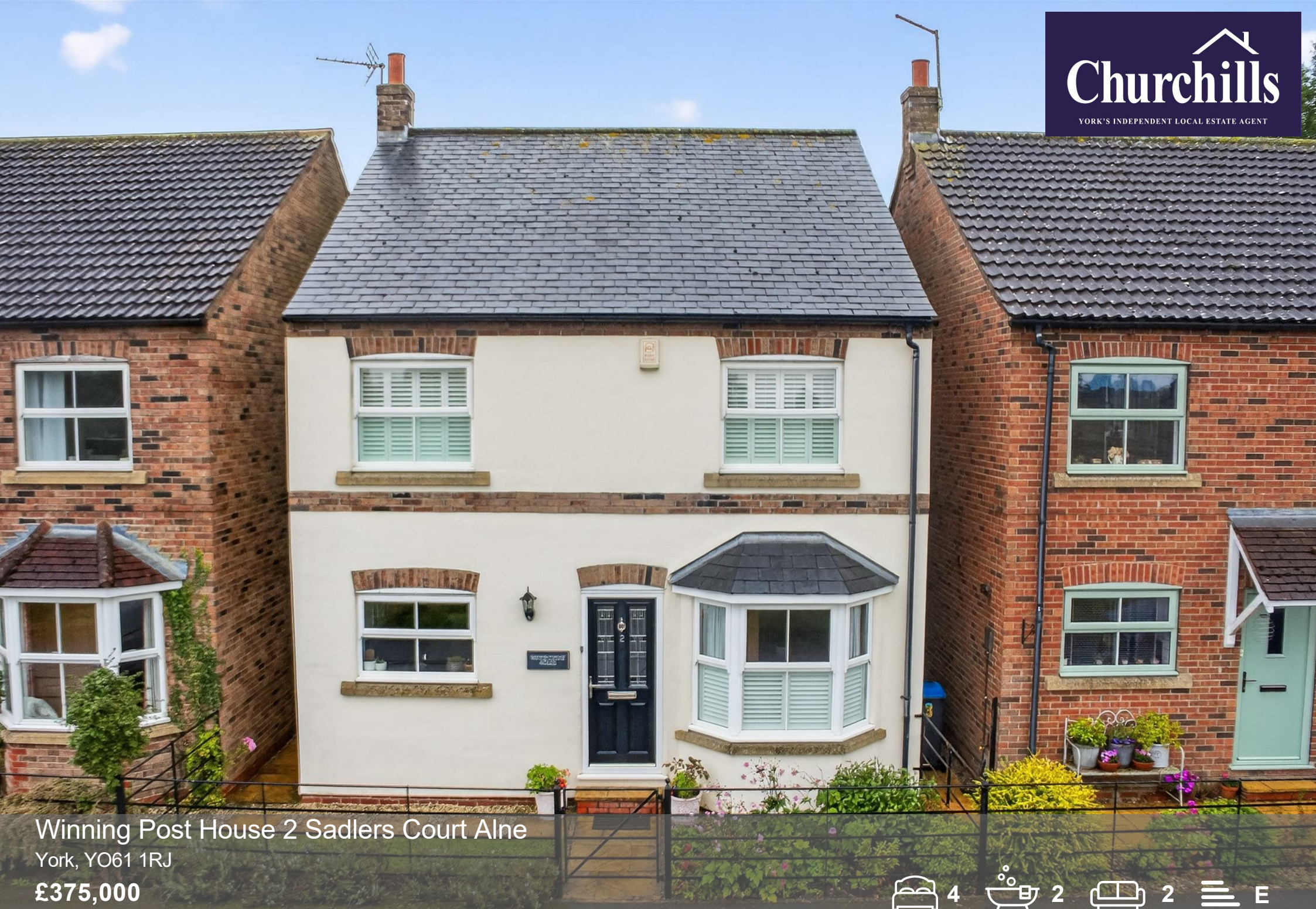
Winning Post House 2 Sadlers Court Alne York, YO61 1RJ £375,000